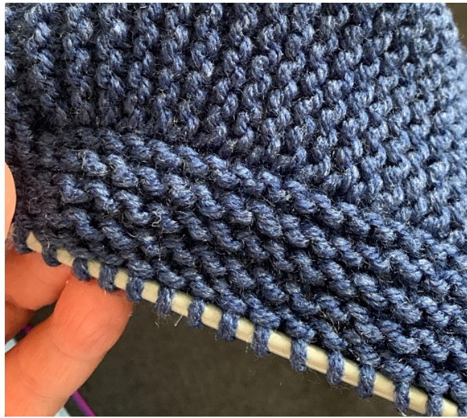
These are the ridges picked up along the toe flap