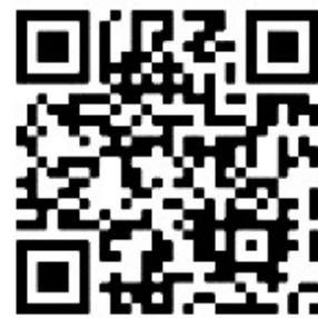
Buy Me a Coffee