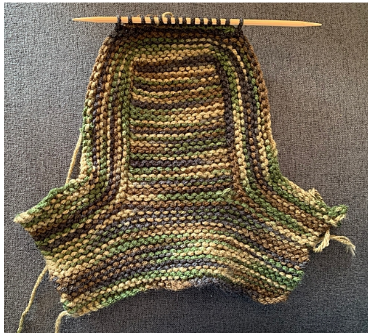
Starting the sole. Right side.

Repeat from d3 to d3 down the entire length of the foot. There are equal number of cast off stitches along each side. How many rows varies depending on the size of slipper you're making. Be sure to end with a completed knit across row.