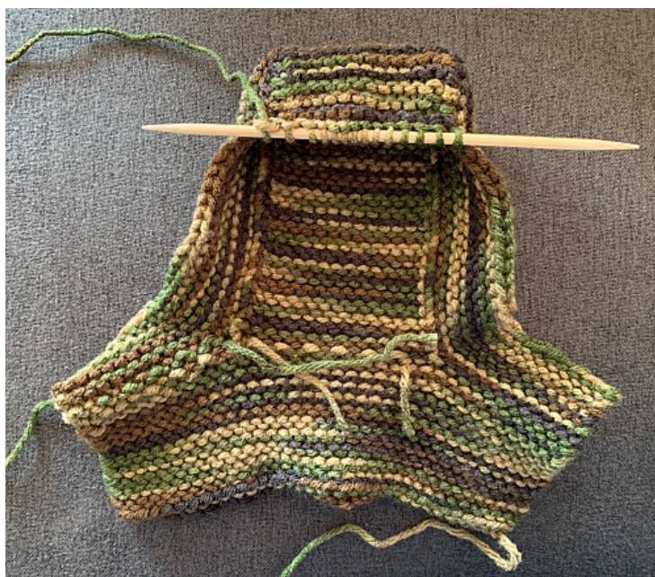
Continuing to work down the length of the sole.