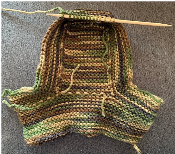
Working your way down while making the sole. Wrong side.